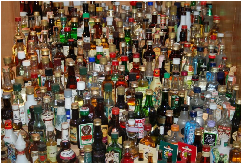
Figure 6.10 Liquor Bottles.

Alcohol use is highly costly to societies because so many people abuse alcohol and because judgment after drinking can be substantially impaired. It is estimated that almost half of automobile fatalities are caused by alcohol use, and excessive alcohol consumption is involved in a majority of violent crimes, including rape and murder (Abbey, Ross, McDuffie, & McAuslan, 1996). Alcohol increases the likelihood that people will respond aggressively to provocations (Bushman, 1993, 1997; Graham, Osgood, Wells, & Stockwell, 2006). Even people who are not normally aggressive may react with aggression when they are intoxicated. Alcohol use also leads to rioting, unprotected sex, and other negative outcomes.