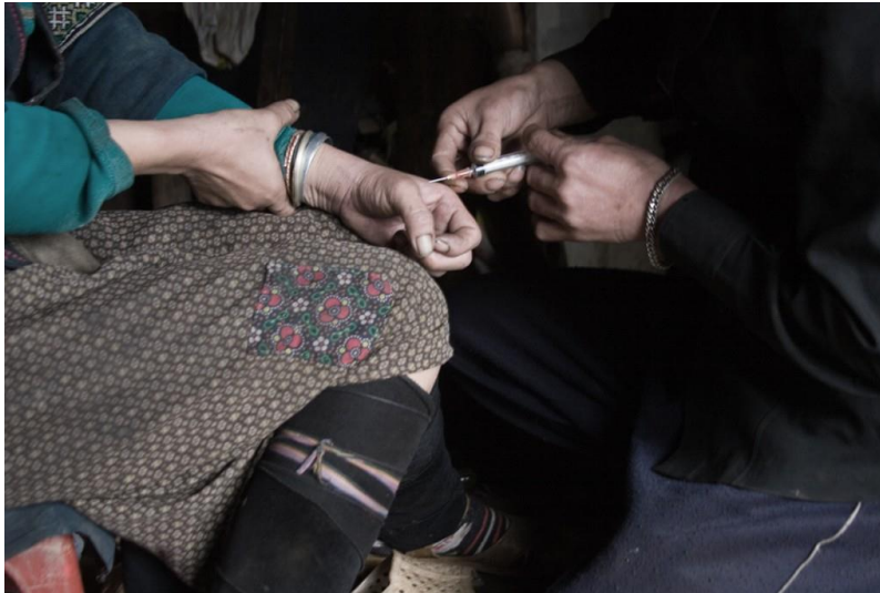
Figure 6.11 Injecting Heroin.

diseases. Opioid addicts suffer a high rate of infections such as HIV, pericarditis (an infection of the membrane around the heart), and hepatitis B, any of which can be fatal.