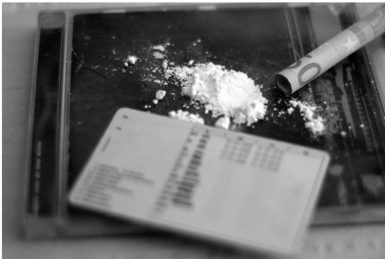
Figure 6.9 Cocaine. Snorting

Cocaine is an addictive drug obtained from the leaves of the coca plant (Figure 6.9). In the late 19th and early 20th centuries, it was a primary constituent in many popular tonics and elixirs and, although it was removed in 1905, was one of the original ingredients in Coca-Cola. Today cocaine is taken illegally as a recreational drug.