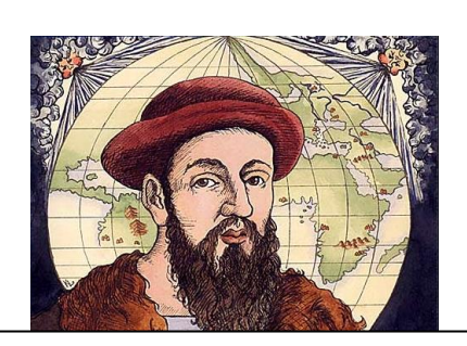
Magellan - The first person to sail around the world.